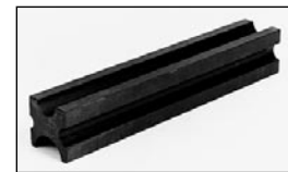
Fig. S15 — Slide Block