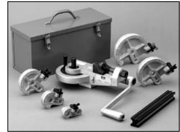
Fig. S13 — 412 Kit